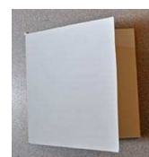
Fold to 'right' like a book