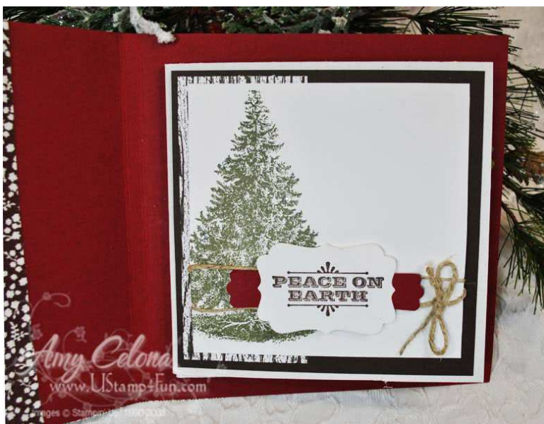
Fig. 1 – Inside Cover

The inside should be adhered to the cover at this point. On the top (front) do the following: