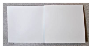
Fold top right 'down' onto bottom right