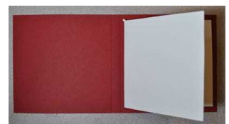
Adhere inside cover centering on right side

STEP 2 - Take the 2 x 8 ½ inch white cardstock and stamp all of the greetings: